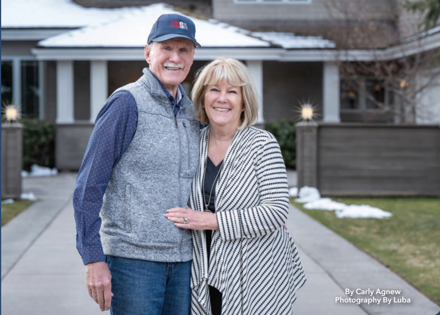
By Carly Agnew Photography By Luba